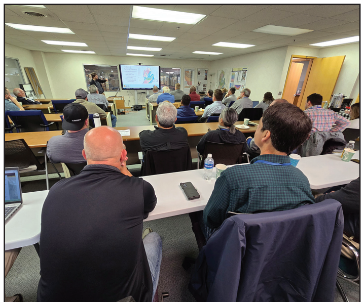
MGS hosted the National Association of Pipeline Safety Representatives as part of their National Meeting in October.